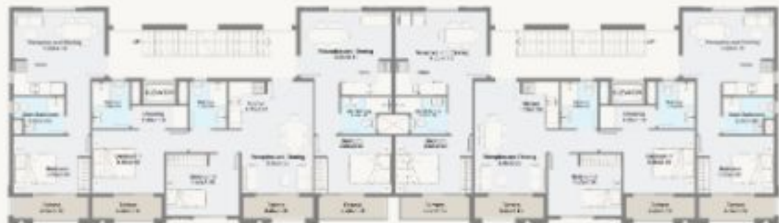
Typical Floor 1,2,3