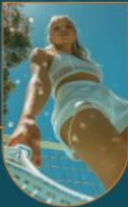
RADEL & TENNIS COURTS